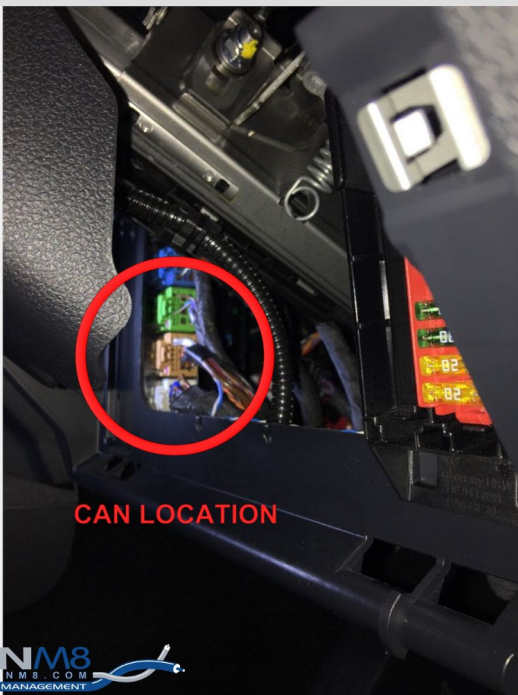
Centre driver's side dash area