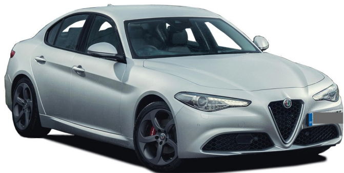
Alfa Romeo Giulia 2015 -